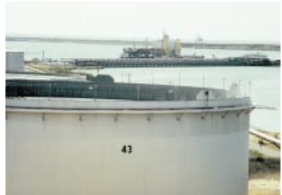
DAS Floating Roof Tank Array

A VHS or PAL format video "Lightning Protection For Flammables Storage" is available by calling LEC. Technical papers are also available on request.