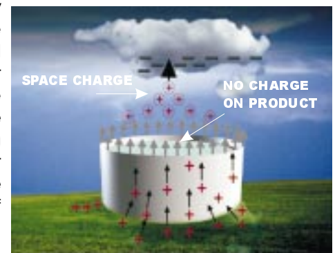
DAS Tank Discharge

The DAS constantly drains the charge from a protected area, leaving that area and the protected site (storage tanks, etc.) virtually without significant charge even in the midst of a worst-case storm.