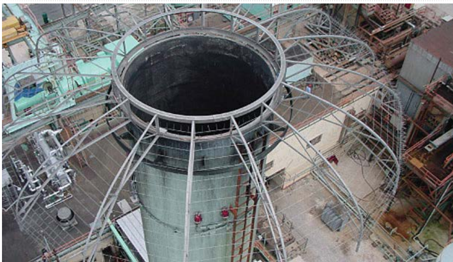
LEC Dissipation Array System (DAS) protecting an oil refinery

KEYWORDS mission critical operations / EMAIL / PRINT / REPRINTS / f t in | MORE / TEXT SIZE+ lightening protection / electrical engineers