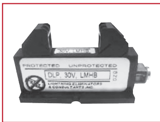
DLP Type MHB & LMHB

Surge protection for ALL types of data lines, instrument lines, phone lines, current loops, and DC circuits.