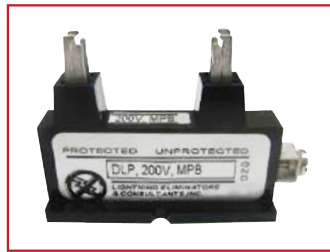
DLP Type MPB