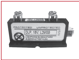
DLP Type MSB, LMSB, & L2MSB