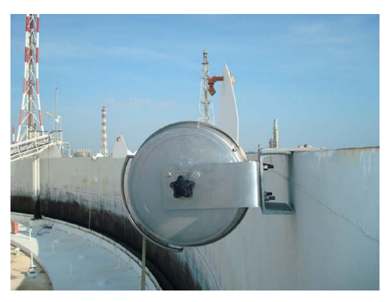
Lightning Eliminator's Retractable Grounding Assembly RGA®

Products used: Engineering Services and RGA®