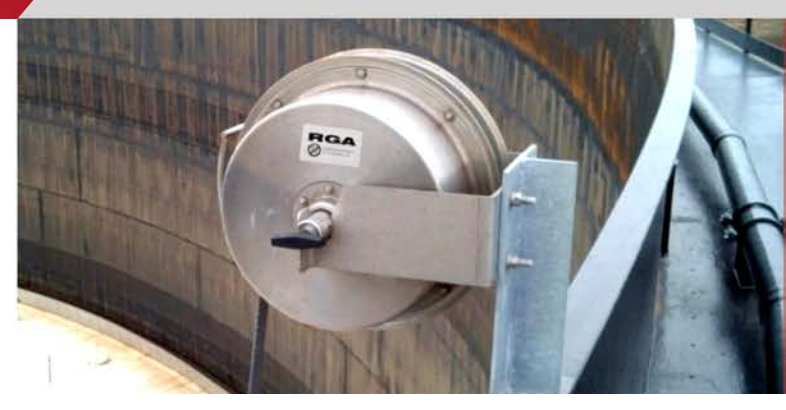
RGA® 750 GENERATION 2 MOUNTED TO A VERTICAL STANDOFF BRACKET* ON A FLOATING ROOF TANK.